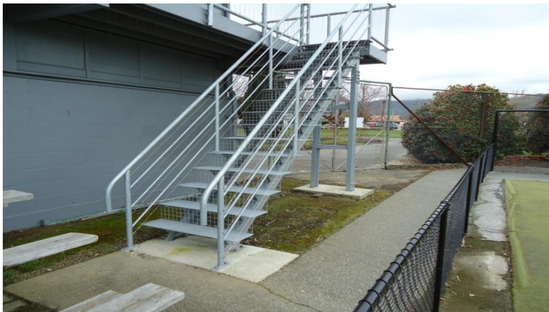
NE end of Court 1, showing area under stairs to be sealed. Water flows from the gate area on to the courts.