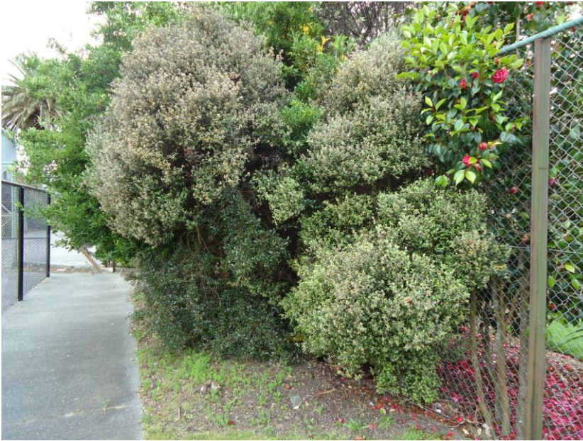
January 2014: Trees within the complex along the east fence, next to Mitchell Park.

One improvement that was part of the project was the restoration of the gate on the east side, which has been permanently locked in the past. However, in a trial period after the fencing work was completed, the gate was being constantly left open. It has now been locked and if access is needed for events such as tournaments the facilities manager has a key.