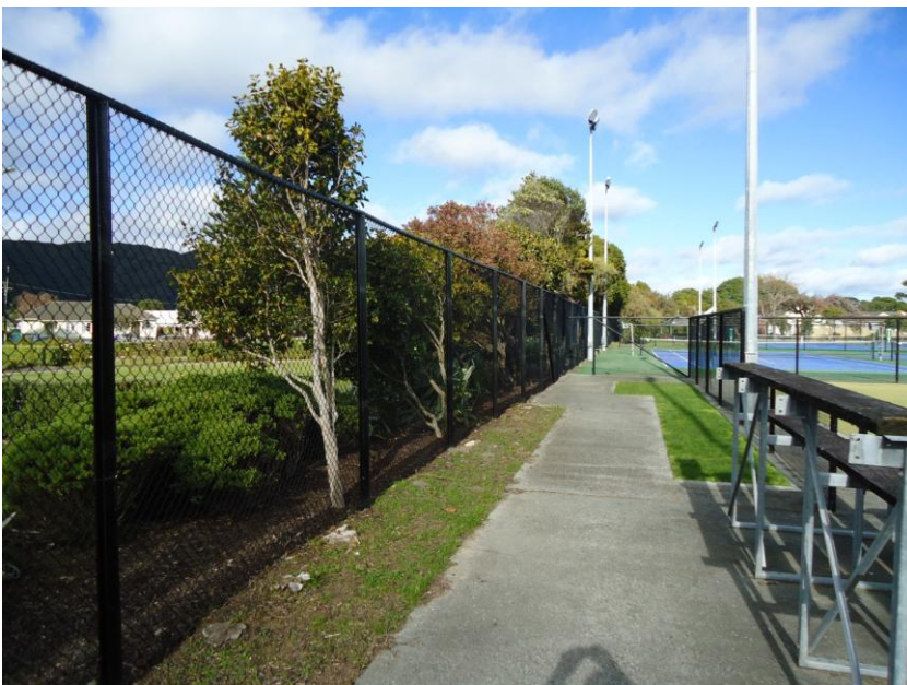
May 2014: New fence along east boundary. Some stumps remain where trees were removed.

Additional work was done by AllTurf at no charge, as they painted and replaced the netting on the south gate so that it matched the rest of the fencing. This was much appreciated, as it completes the fencing project begun in 2009.